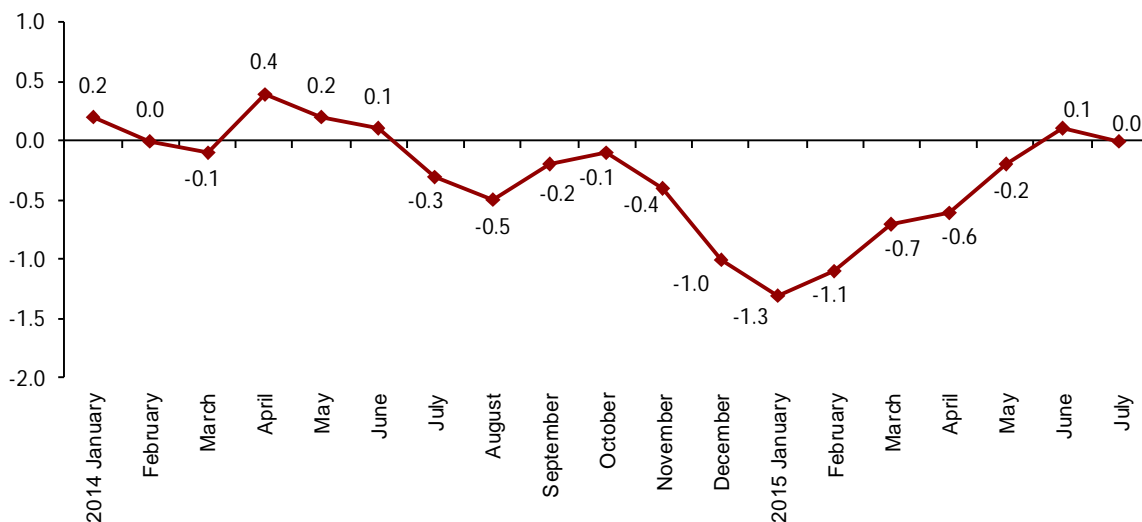
Annual evolution of the CPI, base 2011 (1) Overall Index

(1) The last data refers to the flash estimate