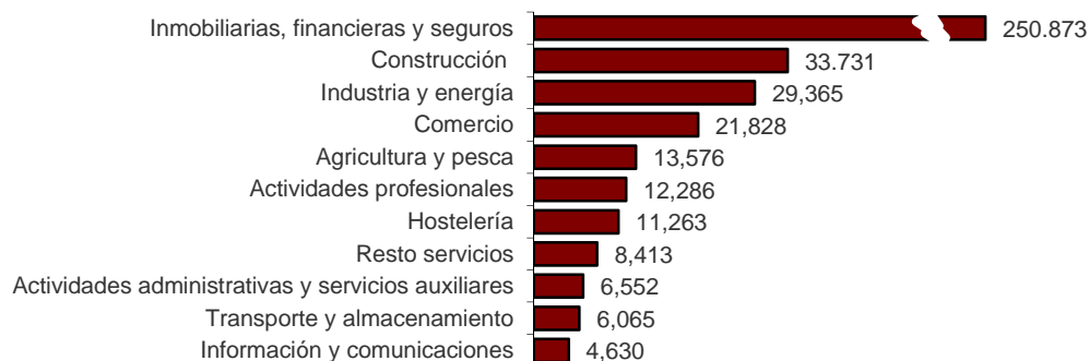
Capital subscribed of mercantile companies created by main economic activity (thousands of euros). June 2018

In turn, Information and communications presented the lowest capital subscribed, with 4.63 million euros.