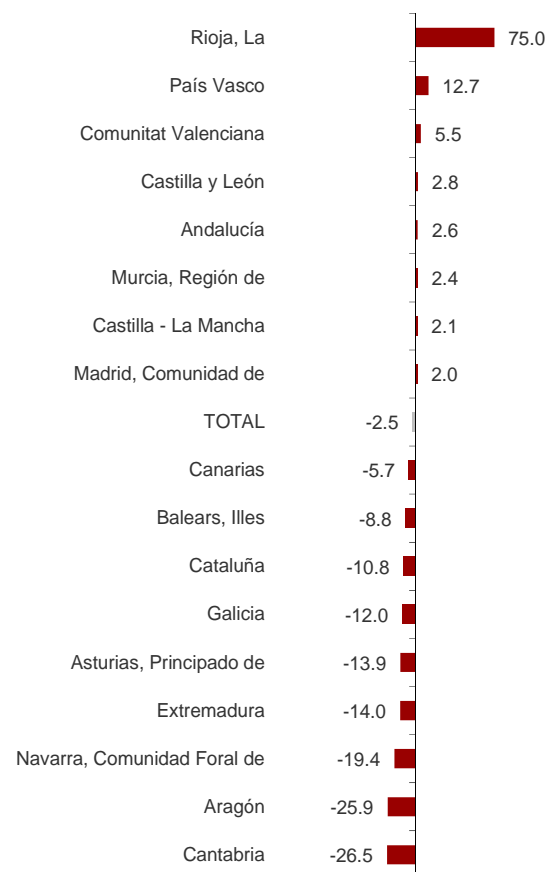
Annual variation in mercantile companies created by Autonomous Communities. June 2018