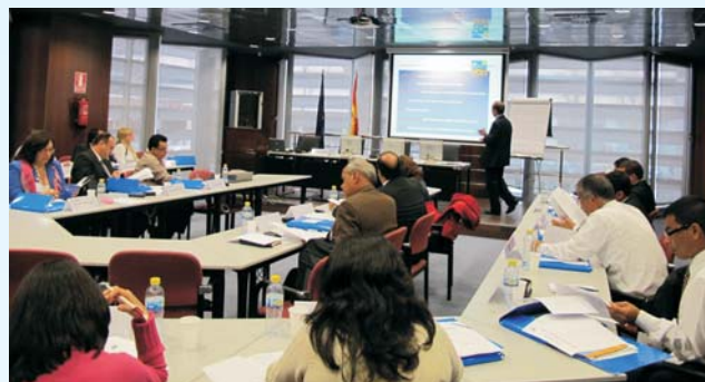
Seminar on Achievements and challenges for communication of official statistics.

The International Relations Directorate , in collaboration with the International and Ibero-American Foundation of Administration and Public Policy (FIIAPP), is responsible for promoting and encouraging the technical cooperation carried out by INE following guidelines set by the Board of Directors and the Master Plan for Spanish Cooperation 2009-2012.