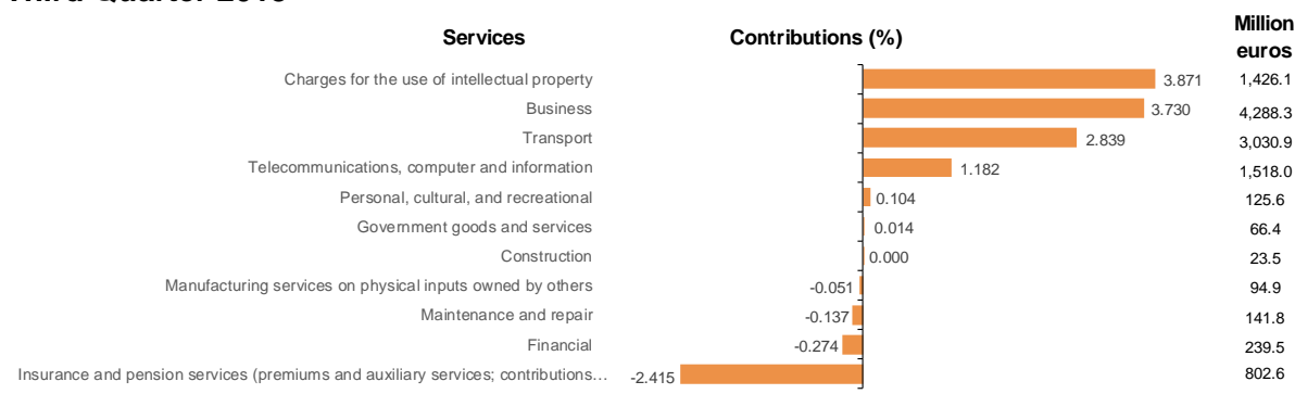
Total imports annual rate 6,8%